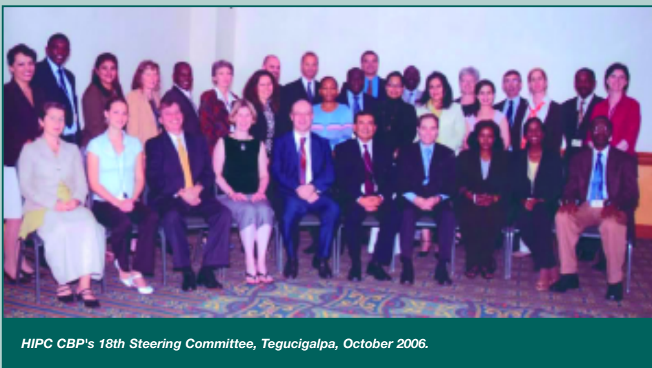
HIPC CBP's 18th Steering Committee, Tegucigalpa, October 2006.