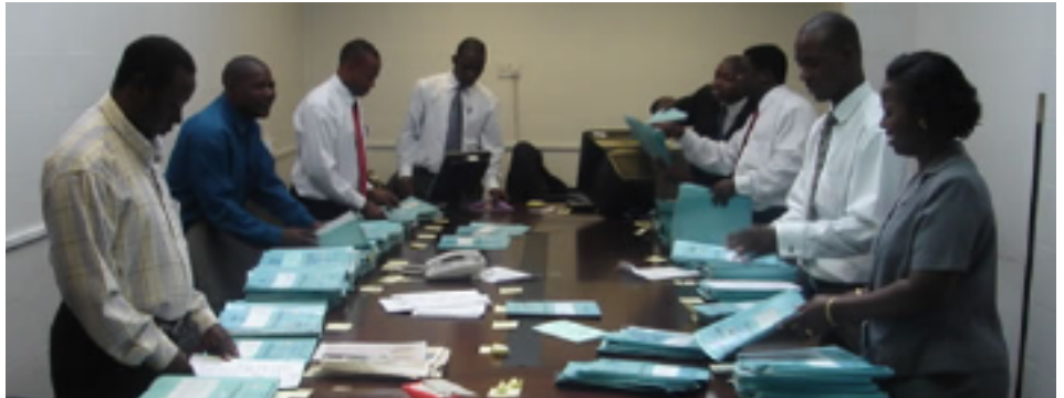
Training Workshop and Data Time Series Mission, Tanzania

Burkina Faso (Q3), Cameroon (Q4), Malawi (Q4), Nicaragua (Q4), Tanzania (Q4) and the Gambia (Q4), and demand assessment missions to Ghana and Kenya (Q4). • Finalise the draft of the publication on