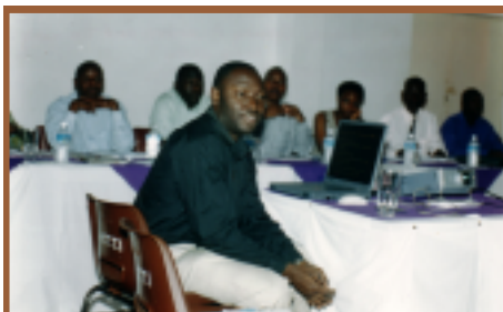
Uganda Opening Awareness and Training Seminar

Trinidad and Tobago has requested a mission