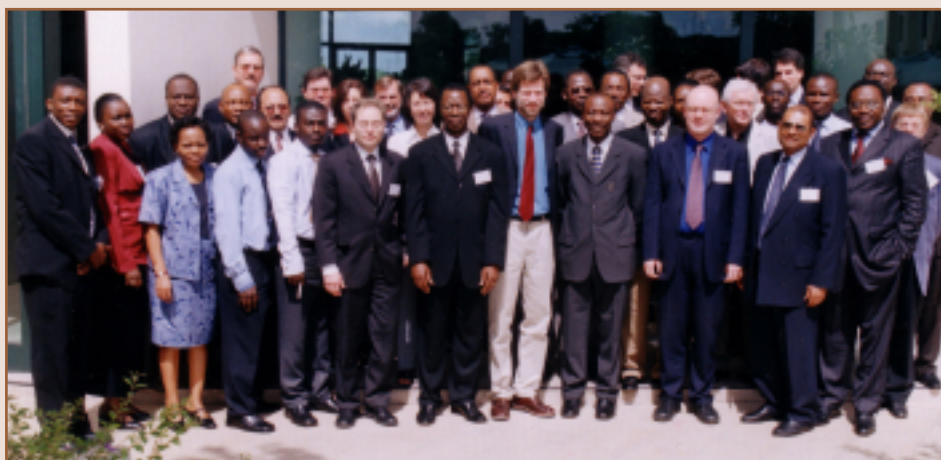
14th HIPC CBP Steering Committee Meeting

The meeting was also informed of progress on a PALOP Institute , to provide comprehensive training to PALOPs in Portuguese. The PALOP governments had finished a project document and committed to funding 20% of the costs and hosting the Institute. The document is currently being presented to donors and IFIs, and the Institute is expected to launch operations at the start of 2005.